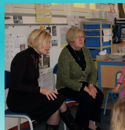
A grandmother discovers a Provençal song (Kindergarten La Serinette, Toulon, France).