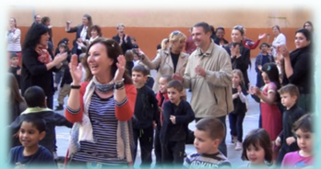
Parents, teachers and children share their knowledge of music and dances from around the world. This activity improves cooperation between schools and families. (Escola Pia de Catalunya, Barcelona, Spain).