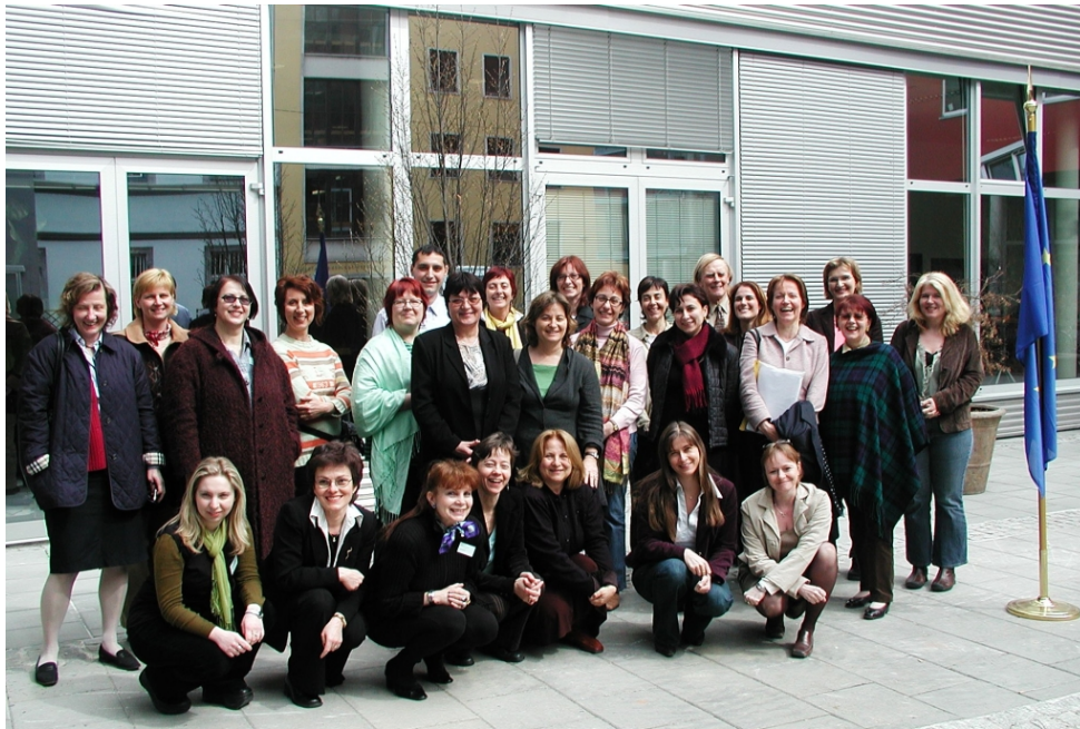
The workshop 3 / 2006 participants

( http://www.ecml.at/mtp2/GroupLead/pdf/wsrepC8E2006_3.pdf )