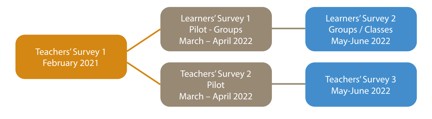
Figure 1: Timeline of the five surveys

The data from the five surveys revealed several transversal themes raised by the respondents irrespective of their roles, sectors, age range,