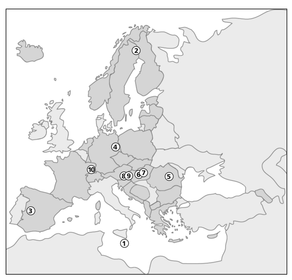
Geographical spread of the case studies presented in this publication: 1) Mgarr, Malta, 2) Pajala, Sweden, 3) Plasencia, Spain, 4) Cottbus, Germany, 5) Braşov, Romania, 6) Budapest and 7) Miskolc in Hungary, 8) Graz, 9) Birkfeld in Austria and 10) Didenheim, France.